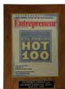
Hot 100 Companies