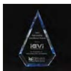
Outstanding Sales Achievement